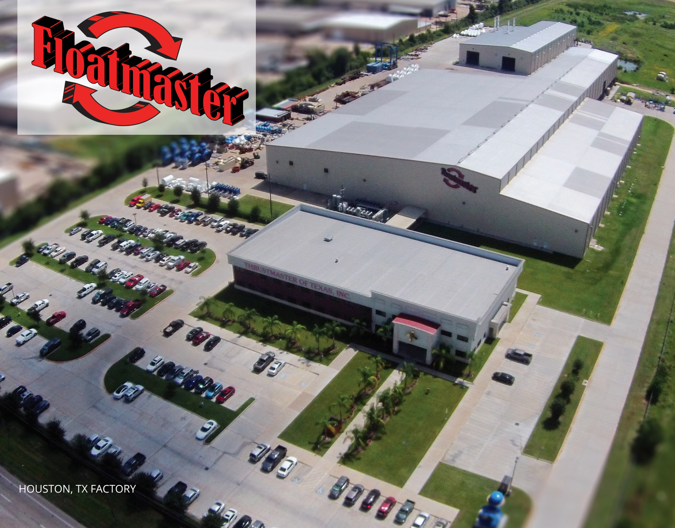
HOUSTON, TX FACTORY